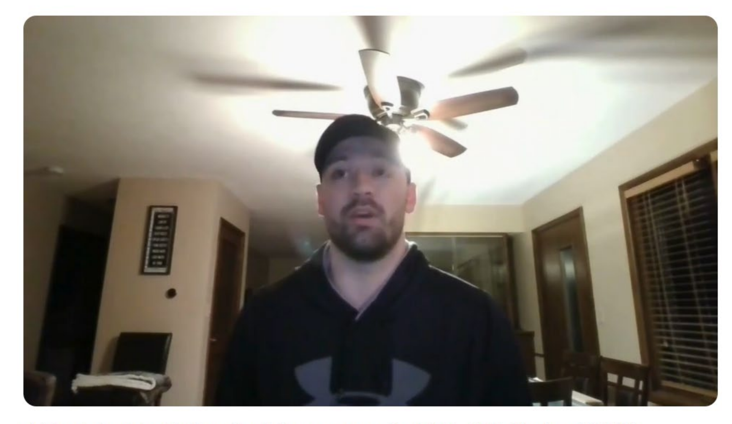
A Peek inside Online Oral Assessments (POL 111 Spring 2024)